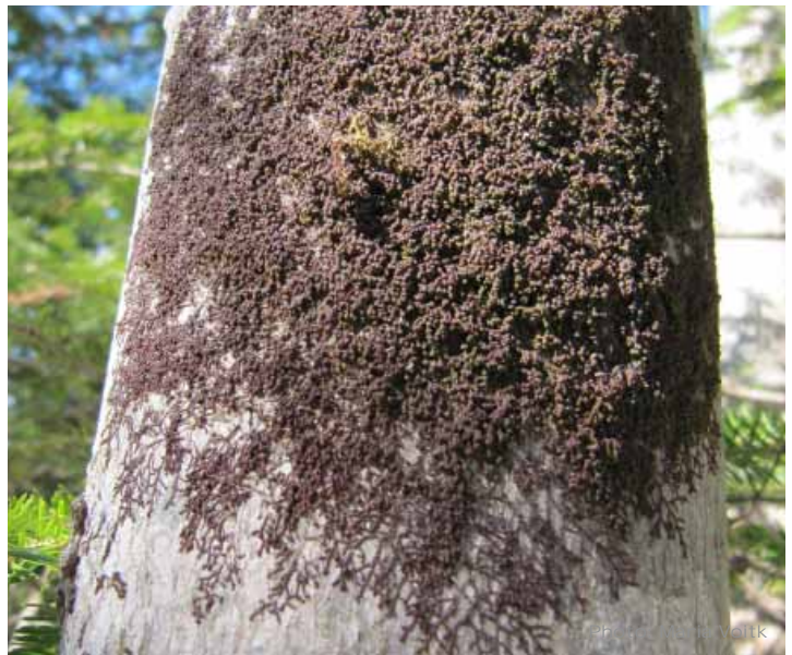
Liverwort on maple trunk