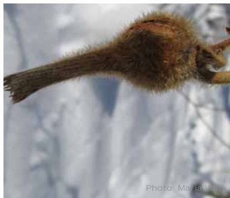
Corylus cornuta , beaked hazelnut nut