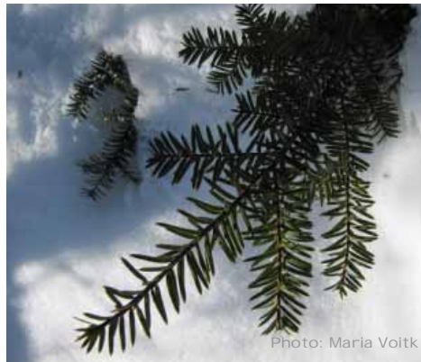
Taxus canadensis , Canadian yew needles flat, stalked, sharp pointed