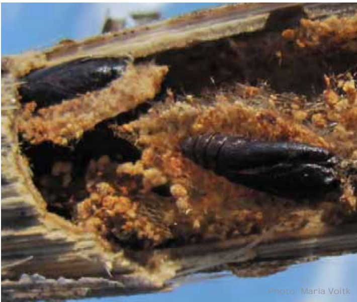
Pupae & frozen frass in cow parsnip stem