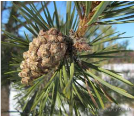
Pinus sylvestris , Scots pine (introduced) 2-needles, short, cones angled backwards