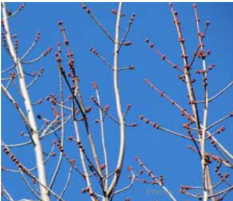
Acer rubrum , red maple twigs red, smooth; always blue sky