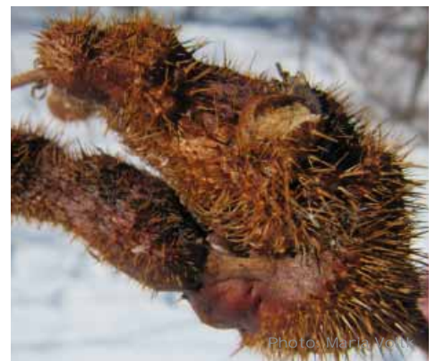
Rubus idaeus , red raspberry gall, probably caused by midge Lasioptera rubi