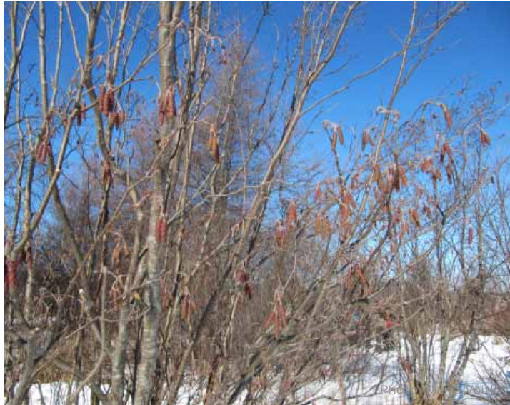
ALNUS RUGOSA , SPECKLED ALDER