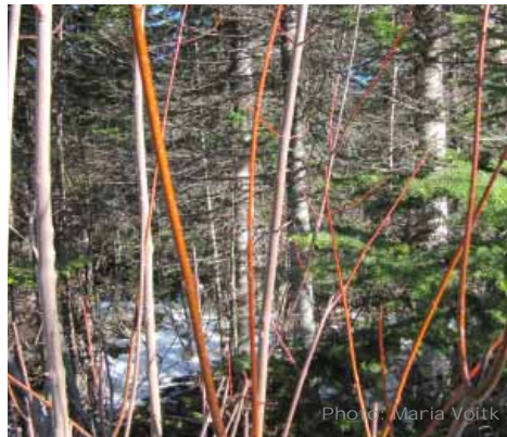
Acer spicatum , mountain maple bushy, tall, new twig bark red and finely hairy