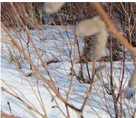
Corylus cornuta , beaked hazelnut Catkins along twig, not only at ends, like alder