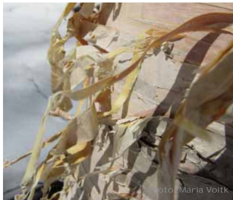
Betula papyrifera , white birch smooth, white bark, even when shredded