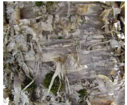
Betula lutea , yellow birch rough, dirty bark, always severely shredded