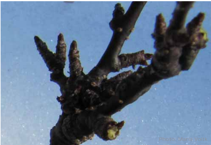
Aphid gall on pin cherry

out the walk, but only raven, crow, blue jay, grey jay, white-winged crossbill, and chickadee were actually identified by participants. A number of insect/plant interactions were noted including pine cone willow galls, willow stem galls, goldenrod stem galls, raspberry galls and overwintering pupae in hollow cow parsnip stems. Participants were amazed at the diversity of wood decay fungi fruiting bodies present at this time of year. As always, the identification of our native deciduous trees and shrubs in winter was an interest and challenge. The beautiful weather, leisurely pace, and nature's abundance made for an enjoyable two hour outing for all of the 35 participants.