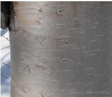
Betula papyrifera , white birch yellow birch is never smooth like this