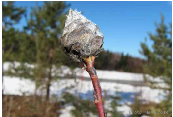
Pine cone willow gall on—you guessed it— Salix