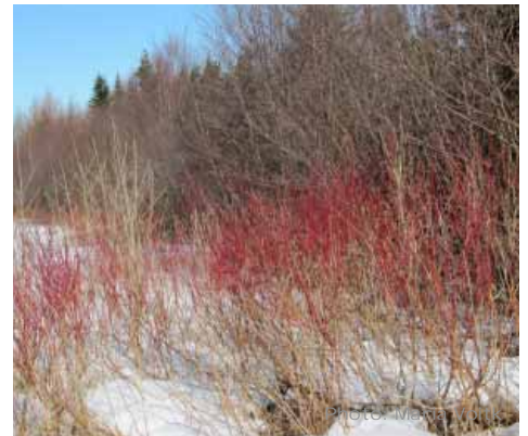
Cornus stolonifera , red-osier dogwood low thickets of bright red branches