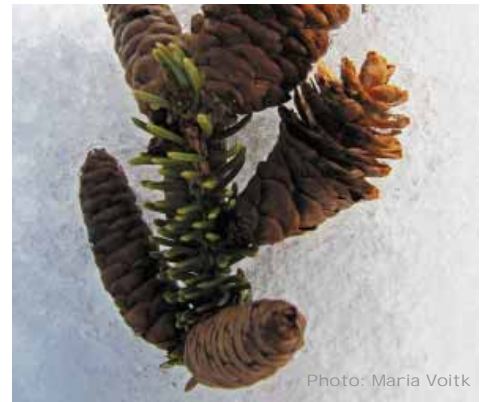
Abies balsamea , balsam fir cones pointed upwards